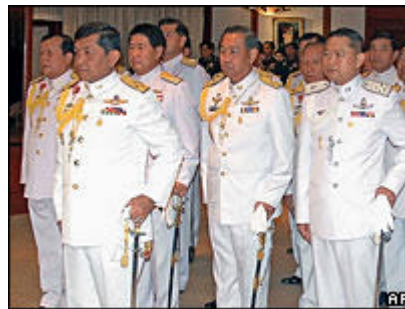
The new leadership is consolidating its hold on power

So rumours of a coup started to circulate like wildfire. But there had been coup rumours all year and it was hard to believe that the people of Thailand, now a vibrant, pluralistic democracy, would tolerate something as unfashionable as tanks and soldiers on the streets.