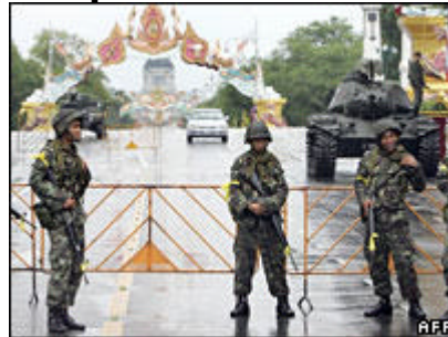
Gen Sonthi says he plans a return to democracy

A military coup in Thailand has seen the ousting of Prime Minister Thaksin Shinawatra.