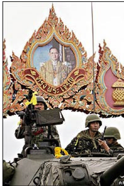
Thai state TV says the revered king endorsed the coup

But sometimes silence speaks volumes - and while there is little evidence that the king