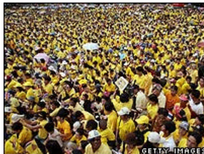
The 60th anniversary of the king's accession in June drew huge crowds

In recent months, the prime minister has angered the palace in several ways, most notably during the king's 60th anniversary in July, when he was accused of trying to seek attention by greeting guests before they met the royal family.