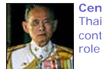
Gen Thai cont role

Thais cheery ov Q&A: Thailand's Countdown to c Political worries Profile: Thai cou Profile: Thaksin Timeline: Thaila