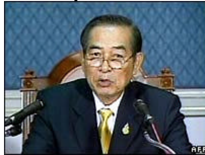
Military announcers read out statements on army Channel 5

As Thai military leaders orchestrated a coup d'etat on 19 September, BBC Monitoring observed that all Thai terrestrial television stations - channels 3, 5, 7, 9 and 11 - had suspended regular broadcasts at about 2200 local time (1500 GMT).