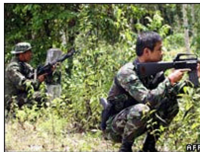
Mr Thaksin has struggled to handle the insurgency in the south

The violent deaths of more than 2,500 people during a crackdown on drugs ordered by Mr Thaksin in 2003 did not affect his public support, neither did an earlier finding by Thailand's Corruption Commission that he had failed to declare all of his wealth.