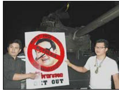
Most of the people on the streets appear to support the coup d'etat

Many streets were completely deserted, but in others small crowds gathered, with everyone asking the same, simple question: "What's happening?"