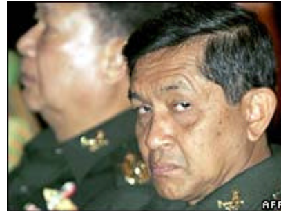
Gen Sonthi is the first Muslim to be commander-in-chief

The leader of the coup in Thailand, Gen Sonthi Boonyaratglin, has made his mark in recent months with some very public disagreements with the man he has overthrown, Prime Minister Thaksin Shinawatra.