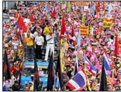
Protests continued in Bangkok in the run-up to April 2006 polls

He founded his Thai Rak Thai (Thai Loves Thai party) in 1998, and its rapid emergence transformed Thai politics.