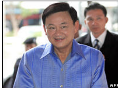
Mr Thaksin's health and economic policies pleased rural voters

Thaksin Shinawatra became the first prime minister in Thailand's history to lead an elected government through a full four-year term in office.