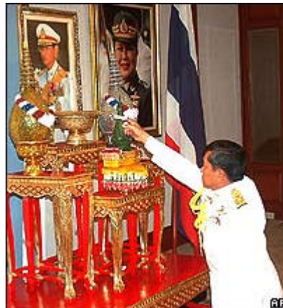
Gen Sonthi has said the monarch supports his intervention

The new leadership has drawn criticism from rights groups for banning all political meetings and assuming legislative duties in the absence of a parliament.