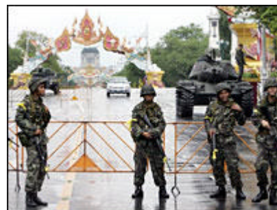
Thai soldiers stand guard in front of the Royal Plaza in Bangkok

Internet's futu Venezuela reje US hypoallergi Baby dies afte